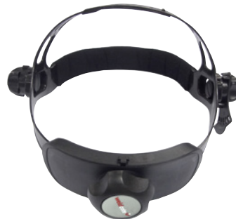
3 Year Warranty