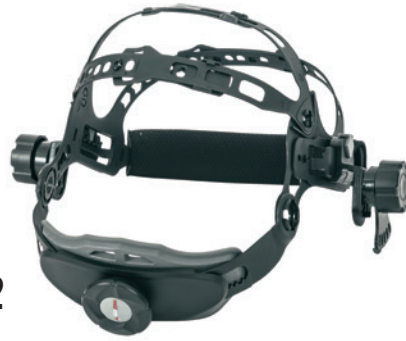
3 Year Warranty